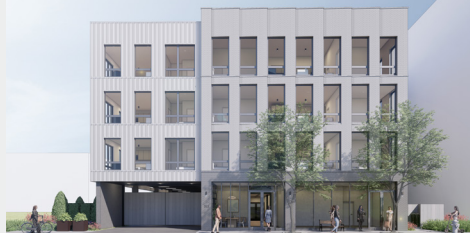
From Top: No 318, No 815, No 311